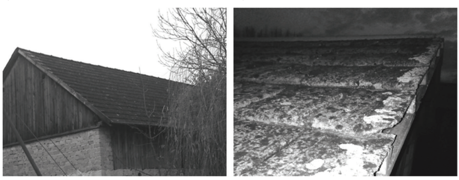
Figure 1. Examples of outbuildings in Bogucice with concrete tiles roofing: a) pigsty, b) cowshed, c) barn, d) henhouse