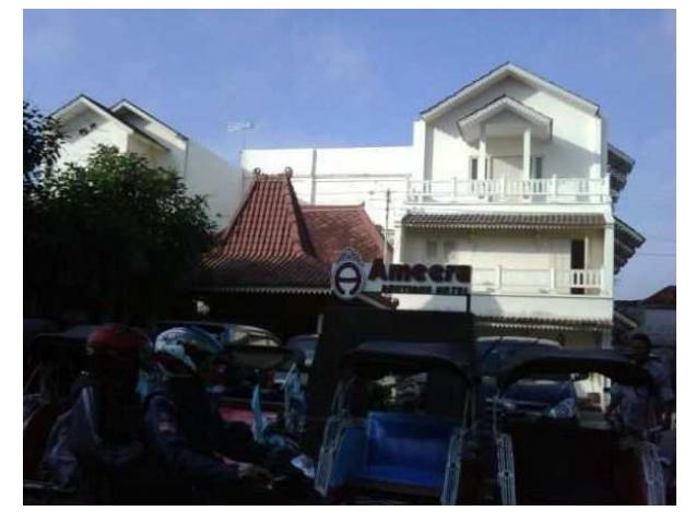
Fig. 4. Small to medium businesses in Dagen Street corridor.

The majority of the respondents have acknowledged that their business places are their properties, while the rent rate could reach IDR 50 million per property per month. Many of the businessmen have lived in the area for ten years, while some of them have even been there for 30 years. The majority of the business places are also home for the businessmen because this area is considered beneficial. Their revenues vary from IDR 15 to IDR 200 million/month. So it is normal that, in the end, the dominant land use is changed to commercial, not residential as previously planned, although many of the building permits are still for residential use. Here is an excerpt of the interview with a key person named Wiwid, Hotel Krishna: