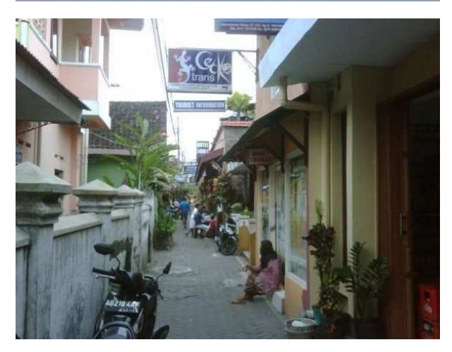
Fig. 3. Small to medium businesses in Sosrowijayan Street corridor.

The high strategic value of the location supported by the demand is recognized by owners of motivating business as causing the land use change. The purpose of family economic improvement is the main consideration for someone to open a business, particularly in support of the tourism business. The rapid growth of economic activities in the area accompanied by changes in the land use also affects the price of land. One of the sources named Mr. Ipung, who has occupied the location for 44 years, states that since he firstly occupied the land to this day, there has always been an increase in land price of around IDR 5 to 10 million per m<sup>2</sup> per year. Here is an excerpt of the interview with Mr. Edi Soebagyo, owner of the Coffee Corner: